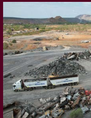
Scrap steel stockpile before