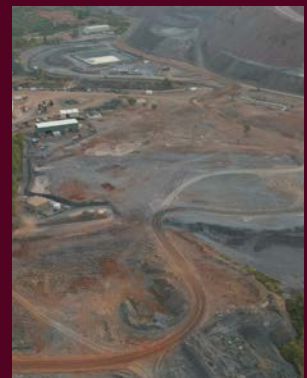
Scrap steel stockpile cleaned up