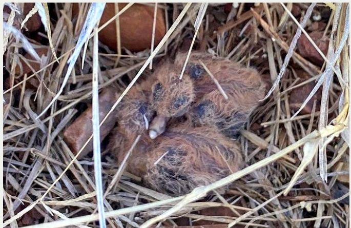
Baby bush pigeons, North West Rock Landform