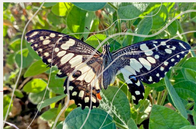
Butterfly, from one of the Analogue sites