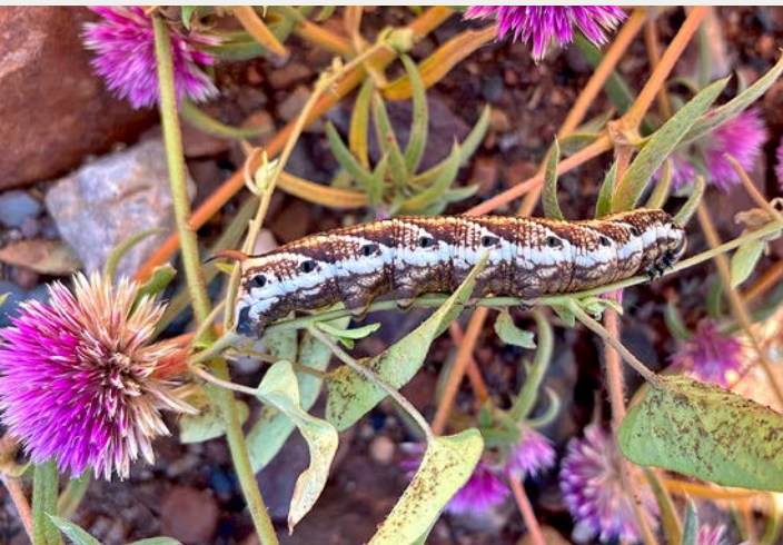
Caterpillar, North West Rock Landform