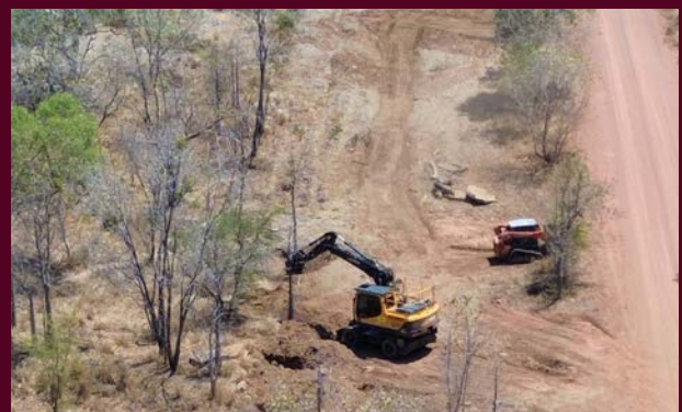
MDM relocating a Boab tree along the Argyle pipeline