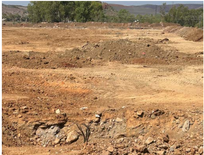
A rock anchor located in the Heavy Mobile Equipment (HME) workshop area

A draft report was received in August and outcomes of the assessment were presented to Traditional Owners during the Infrastructure Information Session in September.