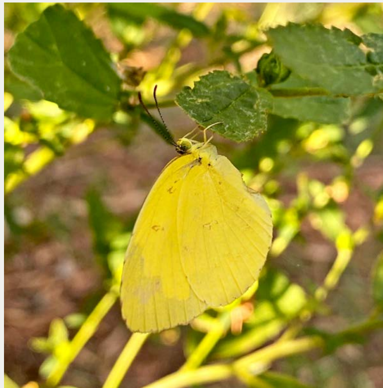
Yellow butterfly at historical rehab at the Alluvial Tailings Dams