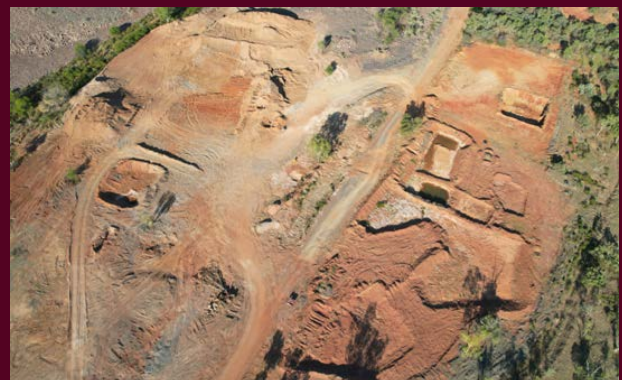
Cleared Light Industrial Area (LIA)

Approximately 16km of bitumen coated pipes have been removed from the Argyle pipeline over the 3 rd quarter and transported to the Wandarrie containment cell for disposal. Small pieces of remaining pipe fragments have been manually removed from the pipe trenches. About 33.5km of bitumen coated pipe have been removed from the Argyle pipeline to date. Approximately 90 Boab trees have been identified along the Argyle pipeline removal work area and are currently in the process of being relocated by Traditional Owner Business MDM.