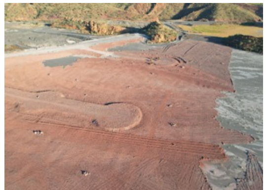
Animal shelters across the Tailings Dam surface

These rock piles will provide shelter and crevices that are known to be the preferred habitats of animals such as goannas and other lizards. With the help of other revegetation techniques such as spreading retained soil and vegetation to establish a vegetation litter layer over time, these animal habitats are expected to attract fauna to the rehabilitated areas. The presence of native animals is a key indicator of a functioning and self-sustaining ecosystem.