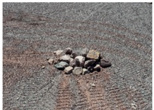
A closer look at the rock shelter habitats