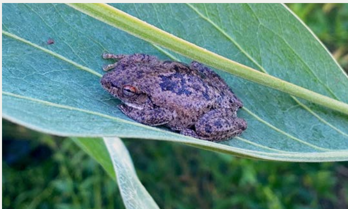
Frog at the Alluvial Tailings Dam 3