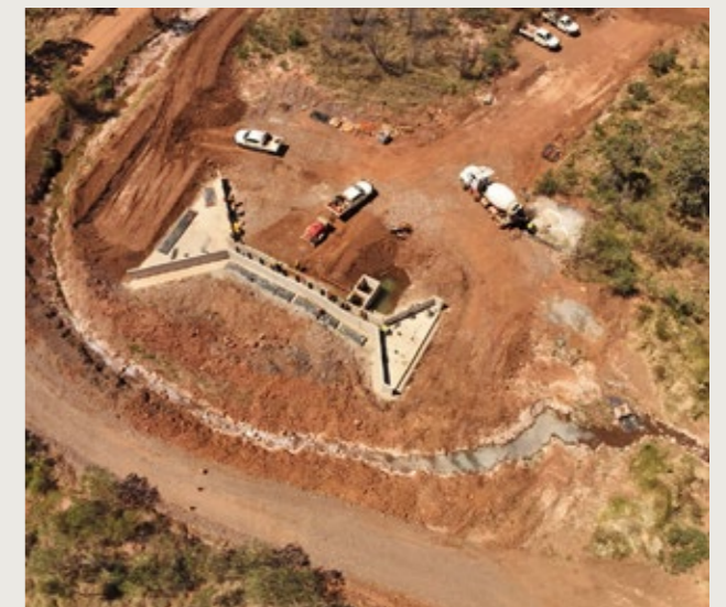
Concrete works on the seepage infrastructure at EWS seep has commenced. The seepage infrastructure is scheduled to be completed in the next quarter.