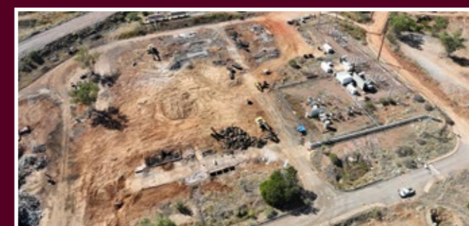
Main photo: Cell 3 construction work at Wandarrie completed Above: Power station infrastructure removal progress

So far, more than 300 tonnes of steel and more than 100 tonnes of HDPE (High Density Polyethylene) piping has been sent offsite to be recycled.