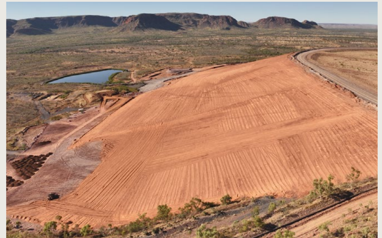
Growth media spreading and rock spreading works ongoing in the Tailings Storage Facility (TSF) Main Dam embankment area.

Bulk Earthworks contract partners Piacentini & Son and MDM Mining & Civil are making great progress across main work areas. Bulk Earthwork is now over 80% complete.