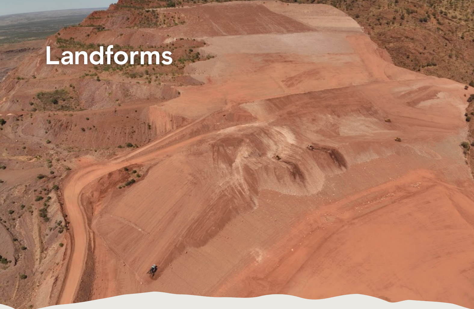
Above: Rock moving and spreading is progressing well in the North West Upper area.