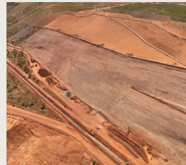
Growth media spreading progressing in the South East domain.