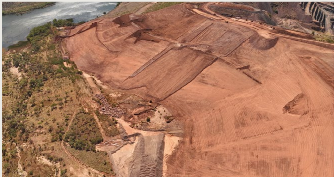
Growth media spreading works commenced in the North Central domain.

Bulk Earthworks contract partners Piacentini & Son and MDM Mining & Civil are making great progress across main work areas. Bulk Earthwork is now over 80% complete.